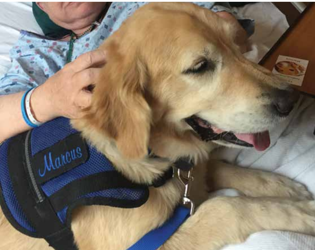
Marcus, one of HSM's PawPrint Therapy dogs